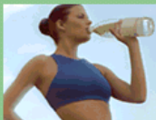
your diet and activity level.