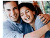
Compatible with your lover?

Creator: Wayne Chappell, 160 Collins St, Hobart, TAS