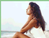
your diet and activity level.